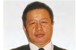
Christian lawyer Gao Zhisheng has not been seen since April 2010

convicted of subversion in 2006 after taking on a series of cases in which he defended the rights of China's unregistered churches ("house churches"). During his five-year sentence, Gao has disappeared six times; on each occasion, he has reportedly been detained and tortured. He has been missing since April 2010, and repeated enquiries to the Chinese authorities have met with no response. Pray for his safe release, and for his family in their distress.