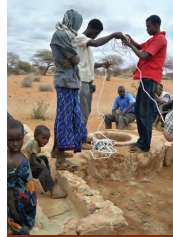
Barnabas has funded borewells for Christians affected by the drought in East Africa

Friday 11 "I cannot believe that we have been remembered. Some people outside there heard that we are in need and sent help to us. God truly sees our plight!" A Kenyan Christian, one of the millions affected by the drought in East Africa, spoke these words of amazement and gratitude when she received help from Barnabas. Give praise that Barnabas has been able to help over 77,000 Christians, often just in time, owing to the overwhelming generosity of our supporters. A Christian family in Uganda, for example, had completely run out of food and had been eating nothing but leaves for four days when they received a parcel containing beans, flour and salt to cover their food needs for a month. Pray that God will sustain suffering East Africans through this crisis and that next harvest's crops will be plentiful.