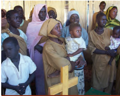
Imprisoned Christian women in Northern Sudan at a service in the prison

Saturday 17 Many Christian women in Northern Sudan, some of them young mothers with their babies, are in jail for not following the version of sharia law prescribed by the government. This includes being fully covered and having a male escort when in public. Barnabas Fund is supporting a women's prison ministry in Khartoum, providing relief