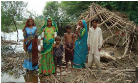
Some Christian families in Pakistan have seen their homes destroyed by floods a second time

Tuesday 1 Many Pakistani Christians found themselves in grievous distress for the second time in little more than a year as surging floods devastated large swathes of Sindh province in September. Millions of people were affected and hundreds of thousands of homes swept away, along with crops and livestock. Thousands were left in emergency camps or in appalling conditions by roadsides. Some affected areas were only just recovering after the disastrous