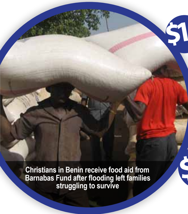
Christians in Benin receive food aid from Barnabas Fund after flooding left families struggling to survive