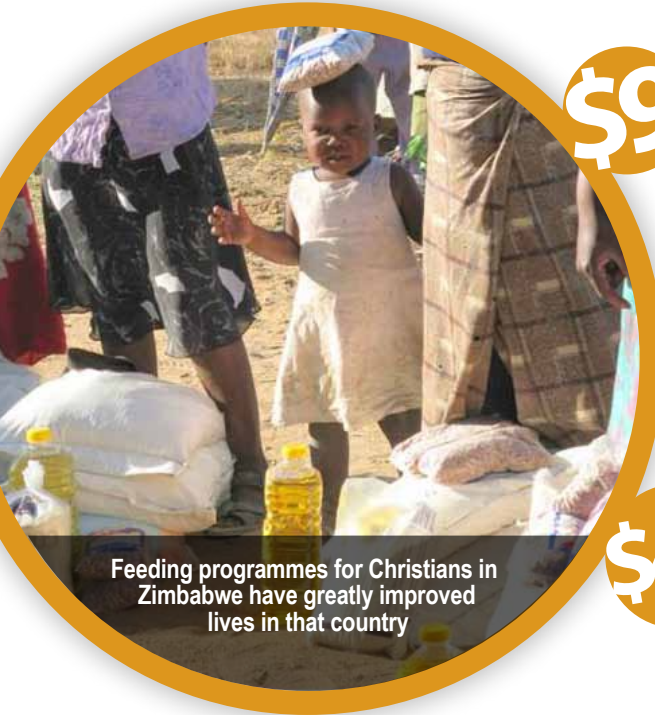
Feeding programmes for Christians in Zimbabwe have greatly improved lives in that country