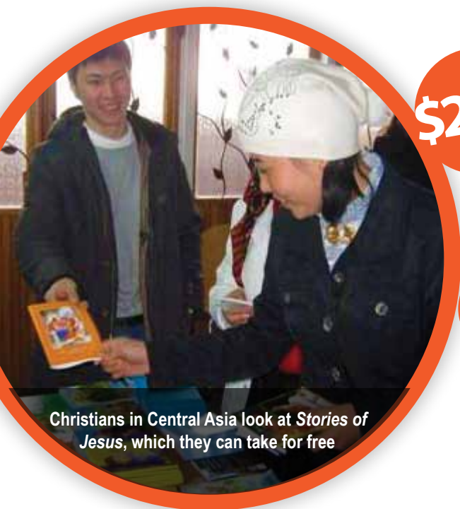
Christians in Central Asia look at Stories of Jesus , which they can take for free