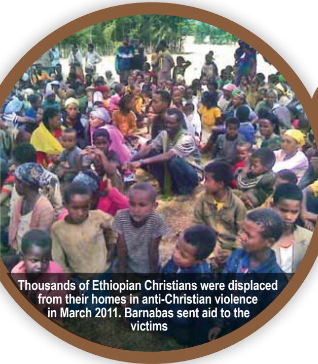
Thousands of Ethiopian Christians were displaced from their homes in anti-Christian violence in March 2011. Barnabas sent aid to the victims