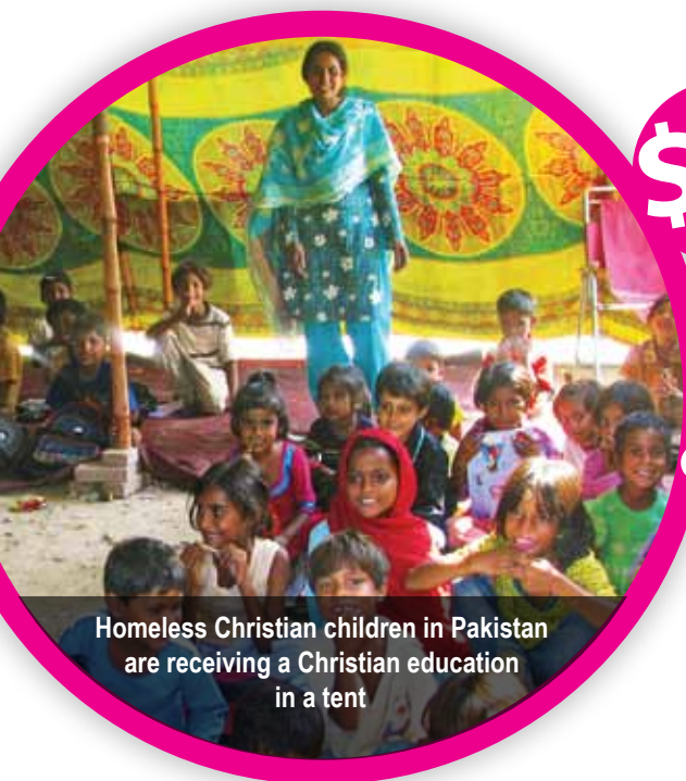
Homeless Christian children in Pakistan are receiving a Christian education in a tent