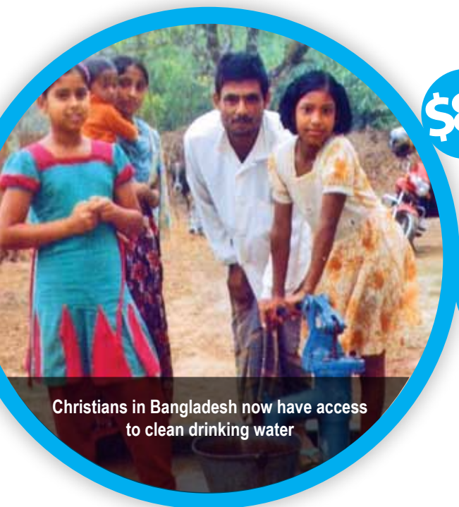
Christians in Bangladesh now have access to clean drinking water