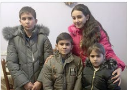
Christian children in warm winter clothing provided by Barnabas