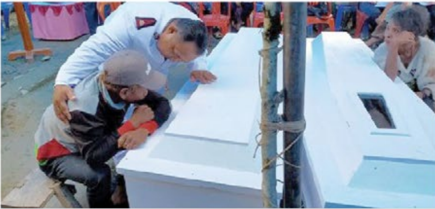
The Christians of a remote forest village in Central Sulawesi mourn with devastated relatives the deaths of four members of the community murdered by Islamist militants

Four Christians were killed in a brutal attack by Islamist militants on a church and homes in a remote Christian community and Salvation Army post on the Indonesian island of Sulawesi on 27 November.