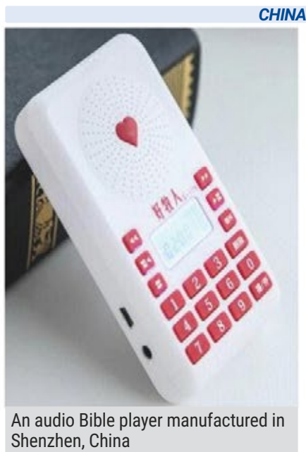
An audio Bible player manufactured in Shenzhen, China

Five Christians have been prosecuted by Chinese authorities in Shenzhen for selling audio versions of the Bible as part of the government’s ongoing policy to eradicate “illegal publications”.