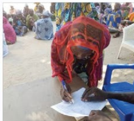
A Cameroon Christian woman signs to confirm she has received food aid

A pastor from a community that suffered atrocities in the attacks said the help given by Barnabas supporters would never be forgotten. He said, “These people [Boko Haram] think they are dispossessing us and discouraging us in our faith, but God is raising up people from far away to come to our aid ... Let us be firm in our walk with the Lord.”