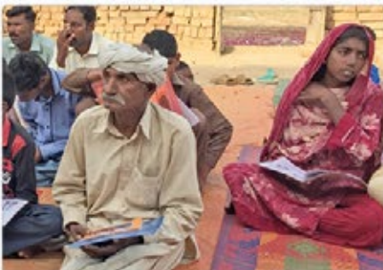
Pakistani Christians are eager to learn at the brick-kiln adult literacy centres