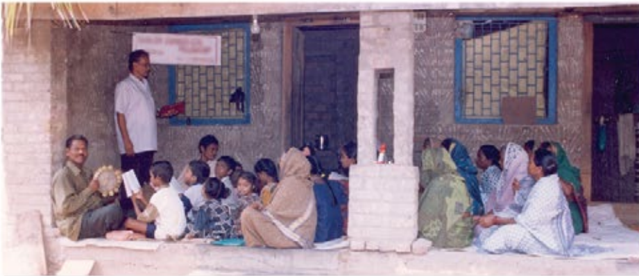
A church service in India. Christians in India comprise nearly 4% of the population

Affairs. While this in itself is not a problem for honest organisations, it puts in place a mechanism that could later be used to limit funding received by Indian Christian organisations from foreign Christian agencies. The act also now requires organisations to renew FCRA approval by October 2021, and without this approval they will be unable to receive donations from overseas.