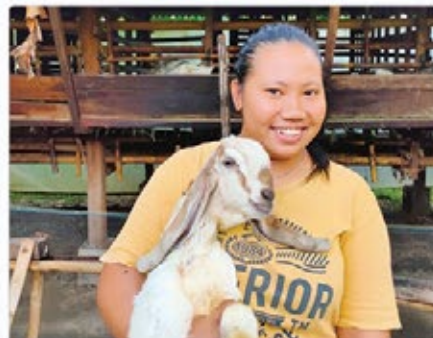
A new Christian with one of the goats provided by Barnabas

“Praise the Lord, we are successful,” said a villager who grows enough vegetables for his family and has surplus to share and sell. Villagers give excess produce to their Muslim neighbours, which is a bridge to share the Gospel with them.