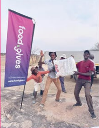
60 tonnes ePap being dispatched from South Africa for emergency feeding of over 8,000 Christians in Zimbabwe