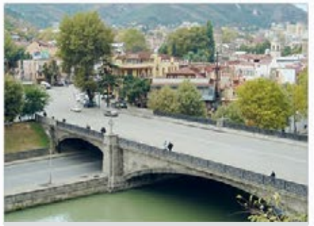
Metekhi bridge in Georgia's capital Tbilisi. Here in 1226 Muslim invaders massacred around 100,000 Christians who refused to convert to Islam. Barnabas has helped a Georgian pastor strengthen the Church in a Muslim-majority area

Camps for young people, where they enjoyed Bible stories, sang hymns and took part in sports, were especially successful and a good testimony for parents. "Now everything is in a stage of forming spiritual habits, priorities and values among local believers," said the pastor. The project has exceeded expectations, and helped people of all ages and from all walks of life, added our project partner in Georgia.