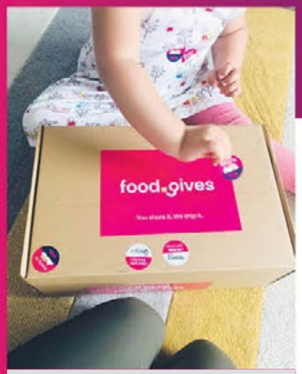
People of any age can make a contribution to food.gives and the work of feeding our hungry brothers and sisters