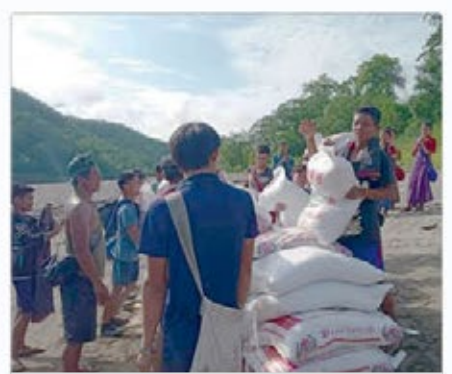
Karen Christians wait patiently to receive one of the 45kg bags of rice

But their faith remains unshaken. "Even though they are facing unjust treatment and hardship in their lives, they thank God for providing them with rice in the proper time," said the pastor. Many cried tears of happiness at the arrival of the latest shipment of Barnabas aid because "they have once again experienced the caring love of God", he added.