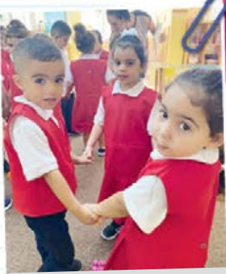
Children get an excellent start in life at St Aphrem's

This excellent start in life will enable students to get better jobs and, in turn, support their families and strengthen the whole Christian community.