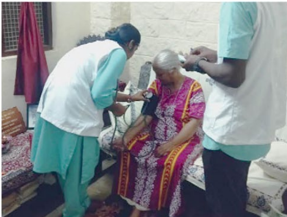
Home healthcare is provided by a Bangalore-based Christian ministry to those with Covid who cannot afford hospital care