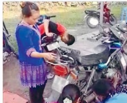
Christians learn the nuts and bolts of motorbike mechanics

Workshops providing training in income-generating skills proved so popular we were asked to repeat them. Forty-two Christians learned motorbike maintenance and received a set of tools to start them in business. Eight women were taught sewing and each given a sewing machine. It is the first time anyone had helped Christians in the locality and they sent repeated thanks to Barnabas supporters.