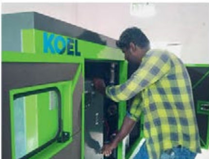
The new generator at Nav Jivan Hospital in Jharkhand state provides power for medical equipment as well as the on-site living quarters of hospital staff

installed an oxygen-generating plant that will prove vital to the survival of the most severely afflicted Covid patients.