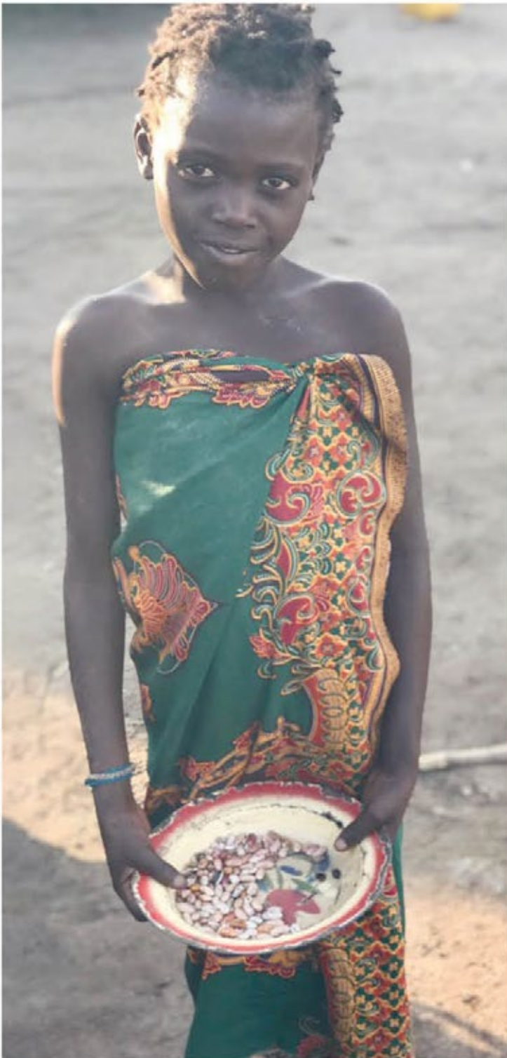
Hunger and food insecurity place Africans, such as this young woman in Mozambique, in danger of not only starvation but increased social unrest, violence and instability

T he second largest continent in the world, Africa is home to 54 nations.* Its population, currently 1.2 billion, is the youngest of all continents, with a median age of 19.7. According to some forecasts Africa's population will double by 2050, outstripping both China and India, with Nigeria having a larger population than the USA. By 2100 Africa may have tripled its current population.