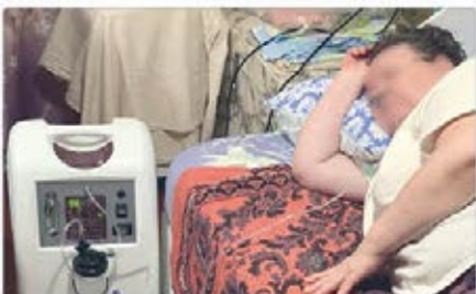
A patient linked to one of the Barnabas-funded oxygen concentrators

A pastor wrote to thank Barnabas supporters. "Through your ministry many people's lives have been saved," he said. "I thank God there are people like you who are not indifferent to the problems associated with the pandemic. Despite the difficult time, you still sacrifice your finances to save people."