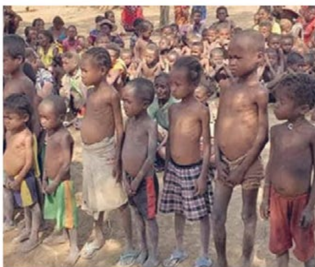
Natural disasters have led to severe drought and famine in Madagascar. Hundreds of thousands are at risk of malnutrition, disease and death

European colonialism has left a legacy of ethnic conflicts, due to European decisions about national borders that ignored the reality of African demographics.