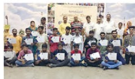
Graduation day for apprentices in Lahore