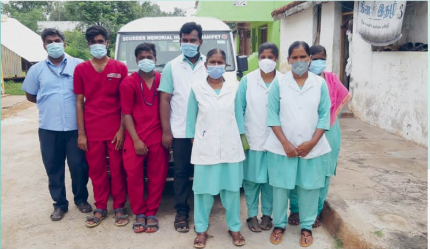
Your gifts are helping Christian nurses, doctors and other carers to combat the onslaught of Covid-19 in India