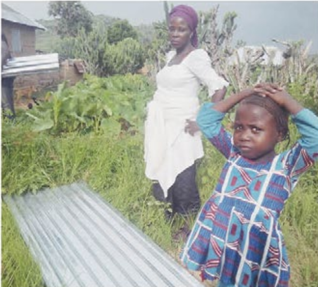
Christians in Kajuru district were among those across Kaduna State, Nigeria, who suffered an onslaught of Islamist violence that killed 300 people and destroyed hundreds of homes in early 2019. Islamist violence throughout Africa continues unabated

In November 2020 the Global Terrorism Index (GTI) reported that the “centre of gravity” for Islamic State (IS – also known as ISIS, ISIL or Daesh) activity had moved from the Middle East to Africa. Africa is experiencing “a surge in terrorism”.