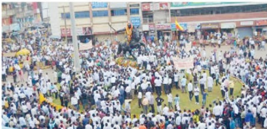
Christians protest against an attack on their community and the proposed anti-conversion law in Karnataka

The chief minister of Karnataka confirmed the state government's intention to introduce a new anti-conversion law. If such a law is passed, Karnataka would join nine other Indian states, including Madhya Pradesh and Himachal Pradesh, in criminalising conversions carried out through force, fraud or allurement.