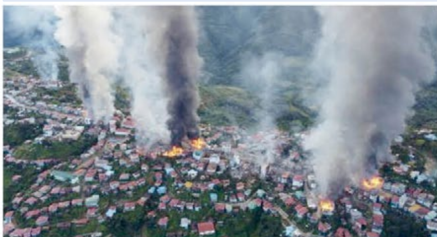
Fires caused by a Tatmadaw artillery attack soon spread across the small town of Thantlang

The Myanmar military (also known as the Tatmadaw) shelled the town of Thantlang, Chin State, on 30 October, causing fires that destroyed or damaged more than 160 homes and three church buildings.