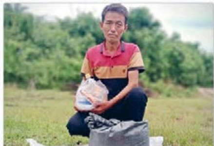
A Christian man receives food from Barnabas to last until the next rice harvest

A Christian said that without Barnabas most families would have had to borrow money at high interest rates or sell what little they possessed.