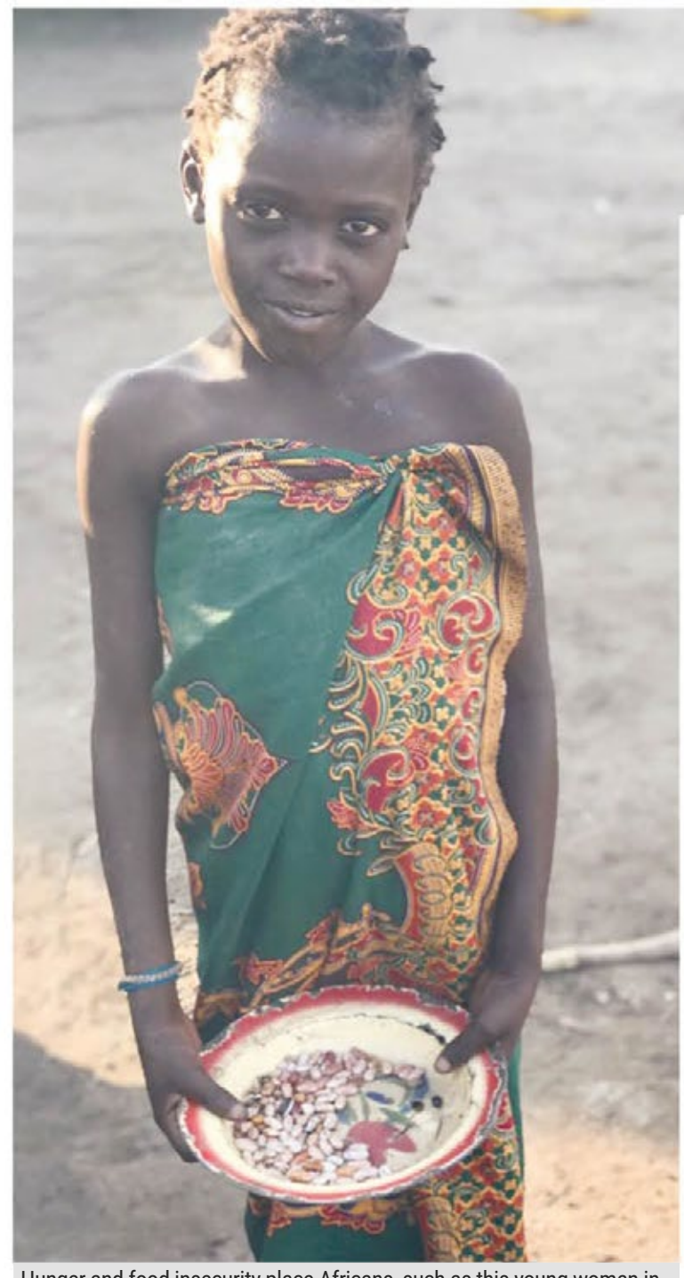
Hunger and food insecurity place Africans, such as this young woman in Mozambique, in danger of not only starvation, but also increased social unrest, violence and instability.

he second largest continent in the world, Africa is home to 54 nations.* Its population, currently 1.2 billion, is the youngest of all continents, with a median age of 19.7. According to some forecasts, Africa's population will double by 2050, outstripping both China and India, with Nigeria having a larger population than the U.S. By 2100 Africa may have tripled its current population.