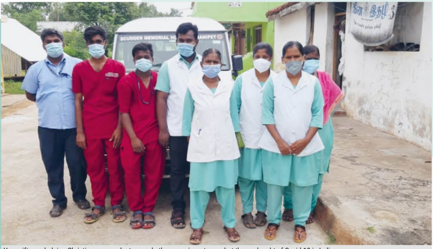
Your gifts are helping Christian nurses, doctors and other caregivers to combat the onslaught of Covid-19 in India.