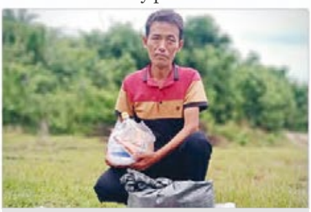
A Christian man receives food from Barnabas to last until the next rice harvest.

A Christian said that without Barnabas, most families would have had to borrow money at high interest rates or sell what little they possessed.