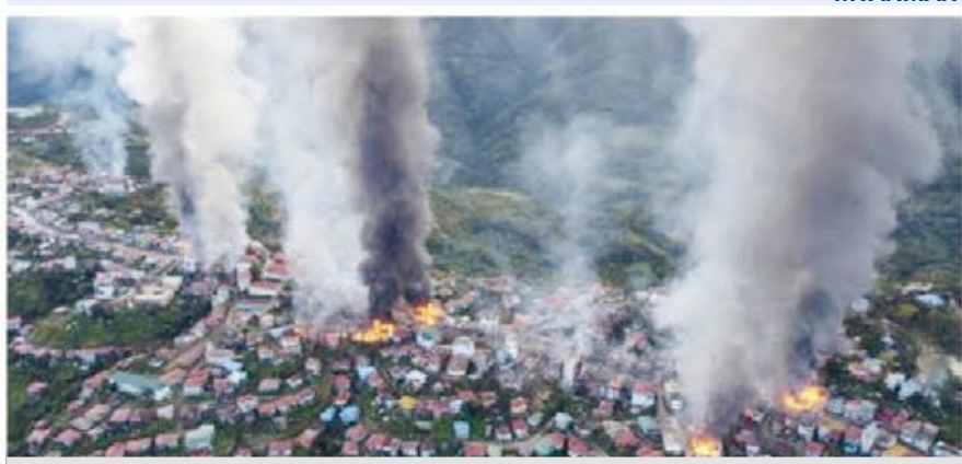
Fires caused by a Tatmadaw artillery attack soon spread across the small town of Thantlang.

The Myanmar military (also known as the Tatmadaw) shelled the town of Thantlang, Chin state, on October 30, causing fires that destroyed or damaged more than 160 homes and three church buildings.