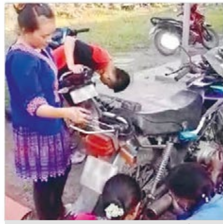
Christians learn the nuts and bolts of motorcycle mechanics.

Workshops providing training in income-generating skills proved so popular that we were asked to repeat them. Forty-two Christians learned motorcycle maintenance and received a set of tools to start them in business. Eight women were taught sewing and each given a sewing machine. It is the first time anyone had helped Christians in the locality, and they sent repeated thanks to Barnabas supporters.