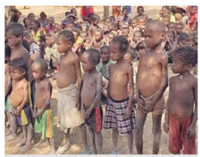
Natural disasters have led to severe drought and famine in Madagascar. Hundreds of thousands are at risk of malnutrition, disease and death.

China is providing much infrastructure in countries such as the DRC, Kenya and South Africa, and the Chinese recognize that government stability is good for business. Yet