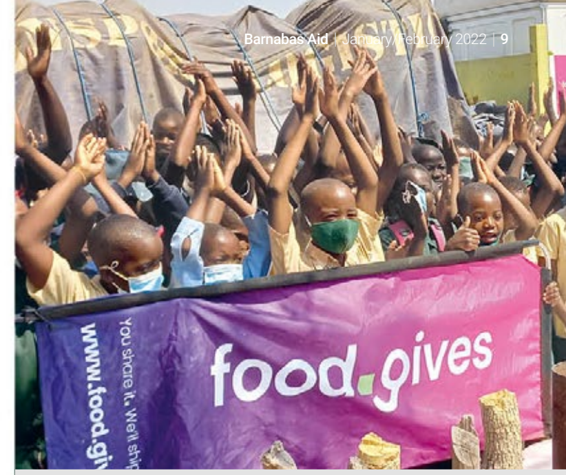
The new food.gives initiative from Barnabas Aid is our way of helping our brothers and sisters in Africa.

Yet Africa remains a continent of deep and unyielding Christian faith. There are hundreds of millions of believers across Africa, with more turning to Christ every day. Increasingly the church in the West, where Christianity is in decline, will look to Africa for spiritual sustenance, support, leadership and evangelism. The kingdom of Christ increases even in the most seemingly helpless and hopeless of circumstances, and "of the increase of his government and of peace there will be no end" (Isaiah 9:7, ESV).