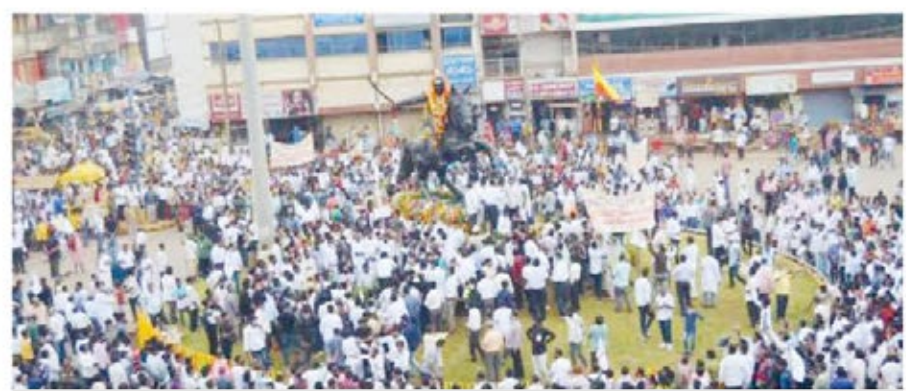
Christians protest against an attack on their community and the proposed anti-conversion law in Karnataka.

The chief minister of Karnataka confirmed the state government's intention to introduce a new anticonversion law. If such a law is passed. Karnataka would join nine other Indian states, including Madhya Pradesh and Himachal Pradesh, in criminalizing conversions carried out through force, fraud or allurement.