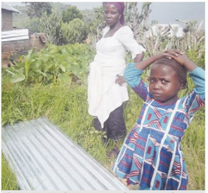
Christians in Kajuru district were among those across Kaduna state, Nigeria, who suffered an onslaught of Islamist violence that killed 300 people and destroyed hundreds of homes in early 2019. Islamist violence throughout Africa continues unabated.

In September, to give just one example, Islamist militants killed 34 people - most of them women and children - in Kaura local government area, a predominantly Christian area of Kaduna state, Nigeria. Even by conservative estimates, around 10,000 people have been killed by Islamist violence in Nigeria since 2015.