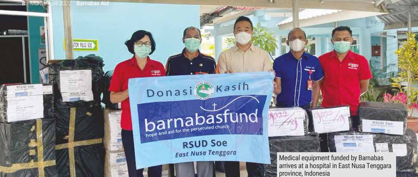
Medical equipment funded by Barnabas arrives at a hospital in East Nusa Tenggara province, Indonesia