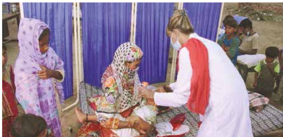
A mother cradles her child during treatment by a nurse from the Barnabas mobile health unit