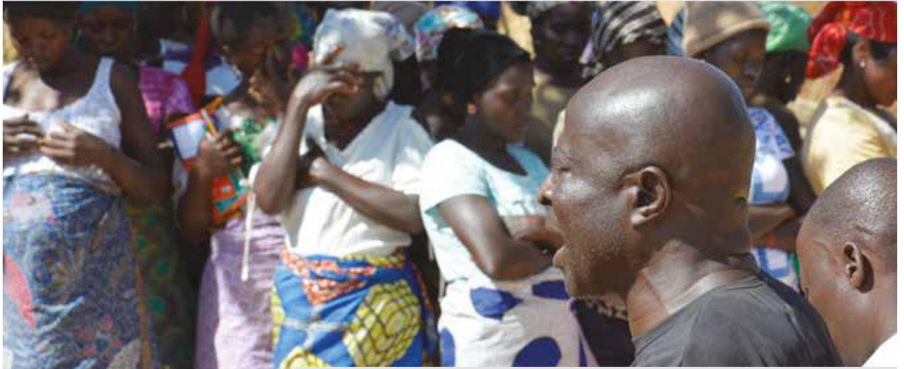
Prayers of thanks for the practical aid made possible through your generous donations