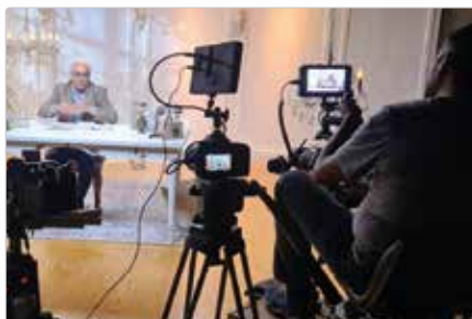
Filming underway for one of the three-minute teaching clips

The clips, which are illustrated with graphics, are in Egyptian Arabic, used throughout the Arabic world. Viewers can also respond via social media and engage with the highly trained project team. A discipleship course has been developed based on the clips.