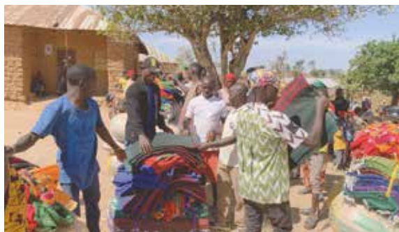
Blankets and mats are distributed to those whose homes have been destroyed or damaged