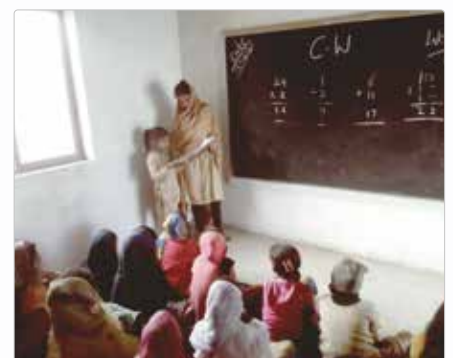
Staff and children have suitable facilities in which to teach and learn

The buildings provide teachers and children of primary school age with suitable facilities in which to teach and learn. A father who never had the opportunity to go to school told us, “Our entire village of brick-kiln workers wants to pay their gratitude to Barnabas and promise to take care of their school buildings.”