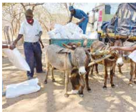
Onward transportation of ePap by donkey in Matabeleland, Zimbabwe

The ePap delivery in November 2021 enabled families to receive sufficient provision for the Christmas break. At the time of writing 63 tonnes of ePap out of a planned total of 81 tonnes have been delivered to Zimbabwe, with further deliveries in early 2022 scheduled to cover the period to the end of the lean season when the next harvest is due.