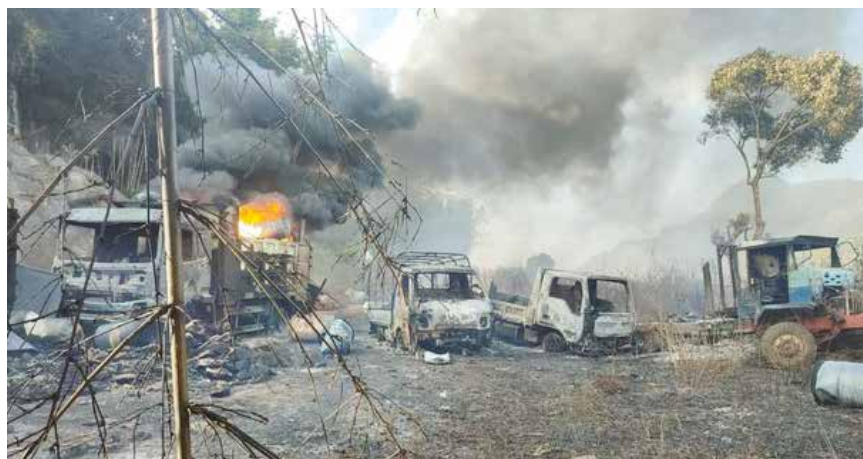
Vehicles set alight near the village of Mo So, Kayah State on Christmas Eve

UK-based charity Save the Children announced that two of its staff were among those shot and burned. A statement from the charity, which has suspended its operations in the region, explained, "The military forced people from their cars, arrested some, killed many and burnt the bodies."