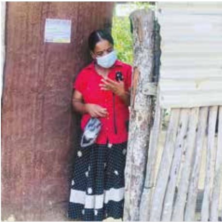
A Christian woman tests her pulse oximeter under the watchful eye of a church volunteer standing a safe distance away