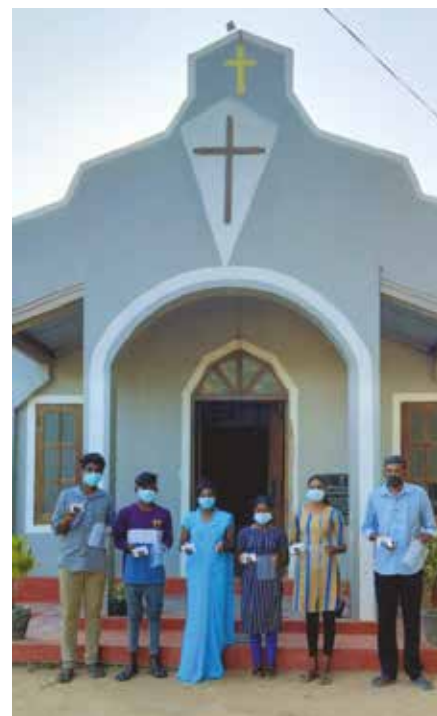
Church volunteers brought comfort and aid to Covid patients in Sri Lanka

In Sri Lanka, Barnabas provided funding for an innovative home care scheme for poor Christians suffering from Covid. It was set up by a group of Sri Lankan Christian healthcare professionals who saw the dire conditions in which many people were struggling to survive after a surge in Covid cases overwhelmed hospitals. Among the most in need were the