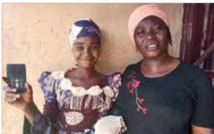
Two Chebar Christian women listen to their “pocket pastor”