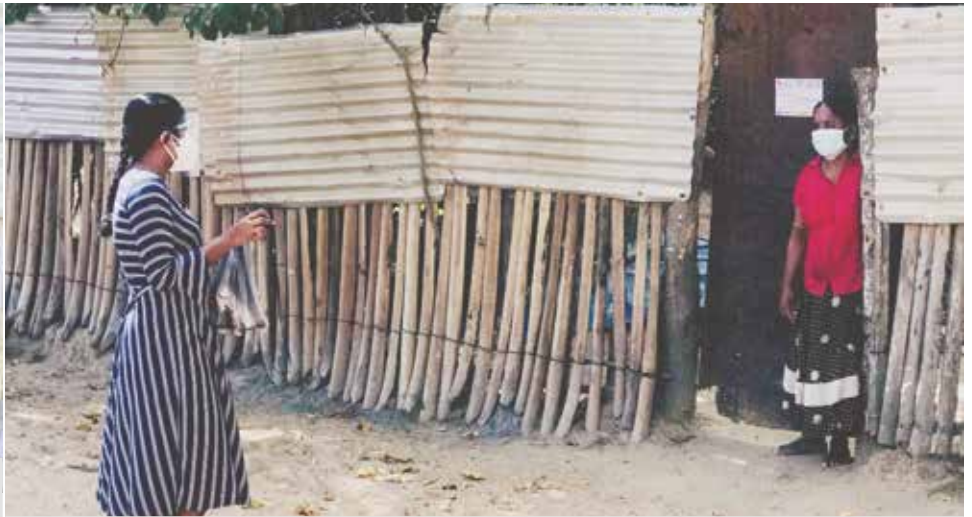
The church volunteer makes sure instructions on Covid care are fully understood

many Christian daily wage earners who lost their livelihoods because of the pandemic, and could not afford to feed to their families, let alone pay for medical care.