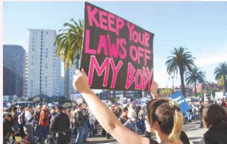
The most common argument in favour of abortion is the bodily autonomy of the individual

The definition of oppression has come to be broadened to include simply the fact that there are people who disagree with your beliefs or your behaviour. This