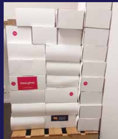
Thank you to supporters from West Hamilton Community Church, Waikato, who filled all these boxes full of food to help feed our hungry brothers and sisters around the world

We are also looking for churches or individuals who have some extra space and can offer to be a box collection centre for your area. This will help us cut costs of shipping and encourage local box donations.