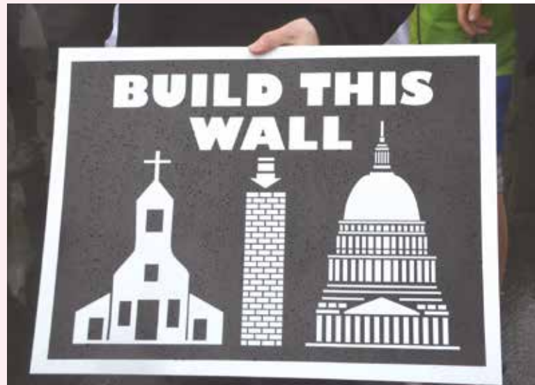
Secularism aims in theory for a value-neutral space, but usually results in hostility towards religion

Yet secularism’s claim to create a value-free public space is deeply flawed. Consider, for example, recent US Congressional hearings where appointees with conservative Christian views were not treated with neutrality but with overt hostility. Supreme Court nominee Amy Coney Barrett, for instance, was told by Senate Judiciary Committee leader Dianne Feinstein, “The dogma lives loudly within you. And that’s of concern when you come to big issues that large numbers of people have fought for for years in this country.” 2