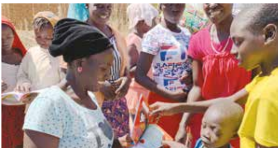
Thanks to Barnabas Fund financial support school books are distributed to children whose education has been disrupted by violence and instability

“We are asking for prayers for the victims of the attacks,” he adds. “We ask for prayers for the pastors and church workers, to never give up hope but to remain the beacons of hope in the communities and villages – to continue to preach Christ with every opportunity.” ■