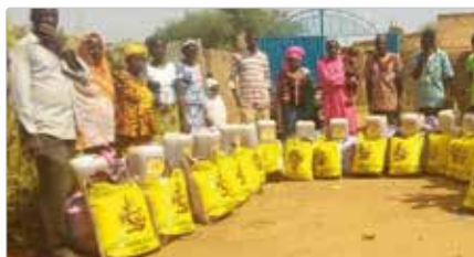
Christians displaced by jihadi violence receive Barnabas-funded food aid

Our project partner said the food aid has encouraged Christians and the church locally to feel part of the bigger Christian family as “they were remembered in their struggle by family members from the UK”.