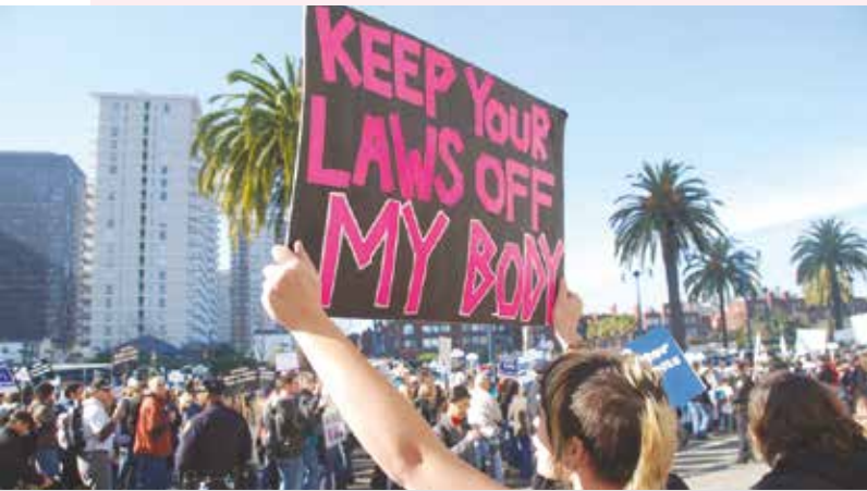
The most common argument in favor of abortion is the bodily autonomy of the individual.