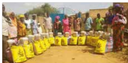
Christians displaced by jihadi violence receive Barnabas-funded food aid.

Our project partner said the food aid has encouraged Christians and the church locally to feel part of the bigger Christian family as “they were remembered in their struggle by family members” from around the world.