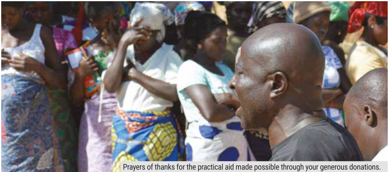
Prayers of thanks for the practical aid made possible through your generous donations.