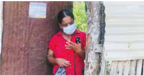
A Christian woman tests her pulse oximeter under the watchful eye of a church volunteer standing a safe distance away.