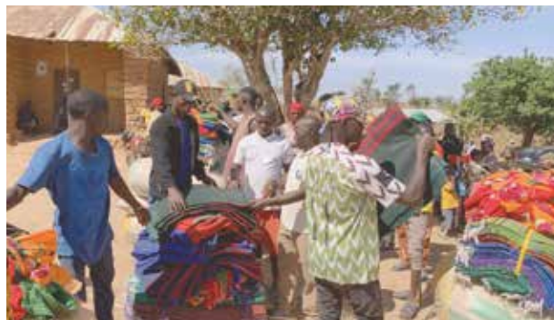
Blankets and mats are distributed to those whose homes have been destroyed or damaged.

“We are asking for prayers for the victims of the attacks,” he adds. “We ask for prayers for the pastors and church workers, to never give up hope but to remain the beacons of hope in the communities and villages – to continue to preach Christ with every opportunity.”