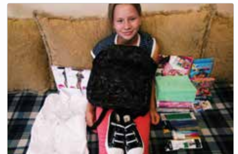
A Kazakh Christian girl with her new school shoes, shirts and leggings.

“The main thing is that people were able to send their children to school with dignity,” said our church partner.