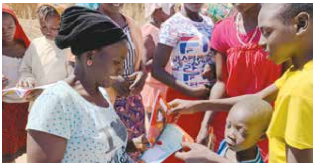
Thanks to Barnabas Aid financial support school books are distributed to children whose education has been disrupted by violence and instability.

The ongoing instability and disruption takes its toll on the lives of children. As part of the distribution of food and supplies, our project partners have provided notebooks, pens and pencils, and flipchart boards, all of which are needed for Christian children to continue their schooling. A total of 810 schoolchildren have been helped in the Miango and Bassa areas of Plateau State.