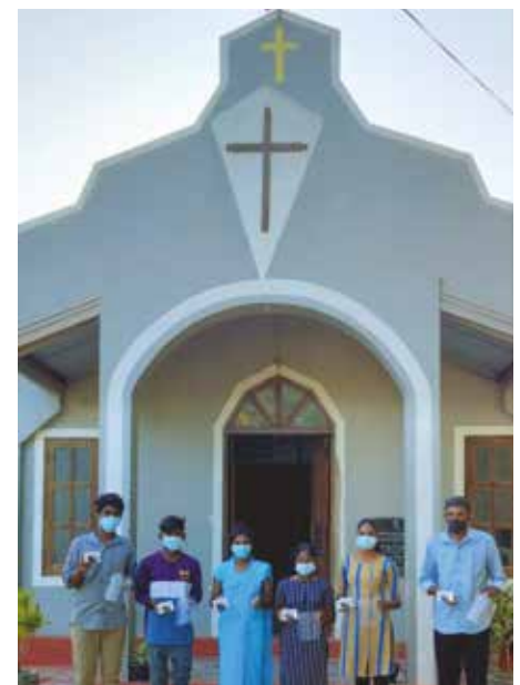
Church volunteers brought comfort and aid to Covid patients in Sri Lanka.

In Sri Lanka, Barnabas provided funding for an innovative home care scheme for poor Christians suffering from Covid. It was set up by a group