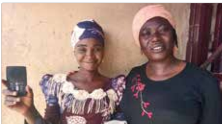
Two Chebar Christian women listen to their “pocket pastor”.