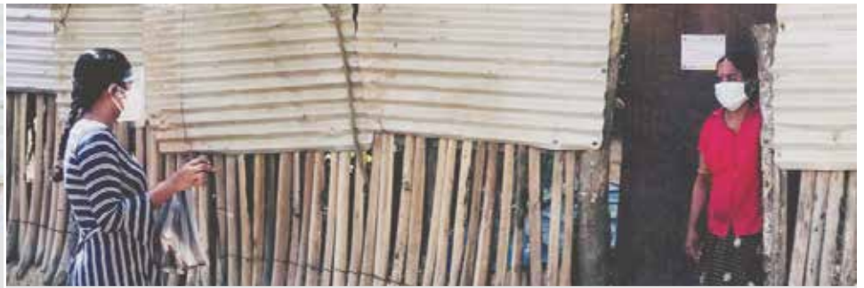
The church volunteer makes sure instructions on Covid care are fully understood.

of Sri Lankan Christian healthcare professionals who saw the dire conditions in which many people were struggling to survive after a surge in Covid cases overwhelmed hospitals.