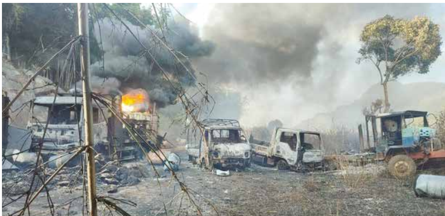
Vehicles set alight near the village of Mo So, Kayah State on Christmas Eve.

U.K.-based charity Save the Children announced that two of its staff were among those shot and burned. A statement from the charity, which has suspended its operations in the region, explained, "The military forced people from their cars, arrested some, killed many and burnt the bodies."