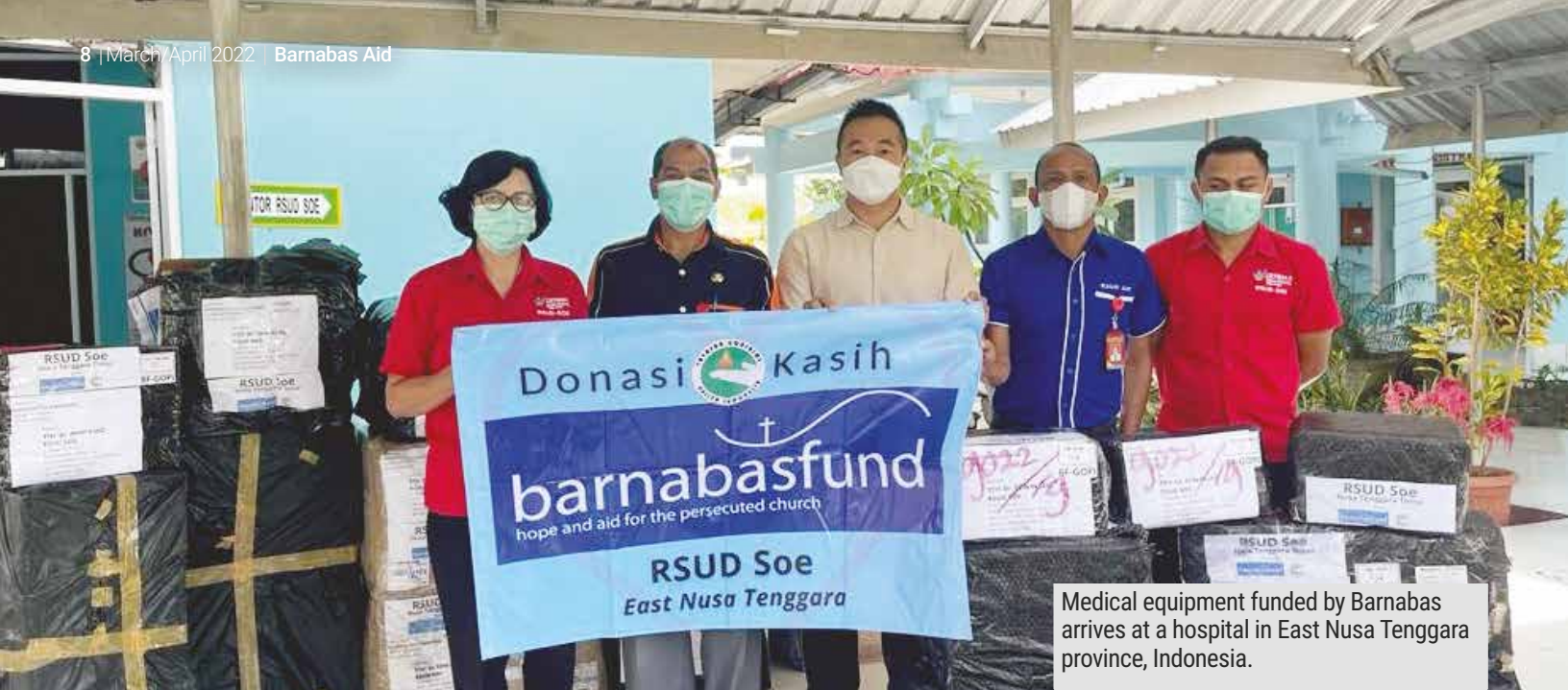
Medical equipment funded by Barnabas arrives at a hospital in East Nusa Tenggara province, Indonesia.