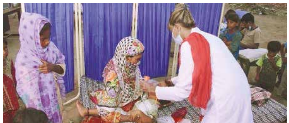
A mother cradles her child during treatment by a nurse from the Barnabas mobile health unit.