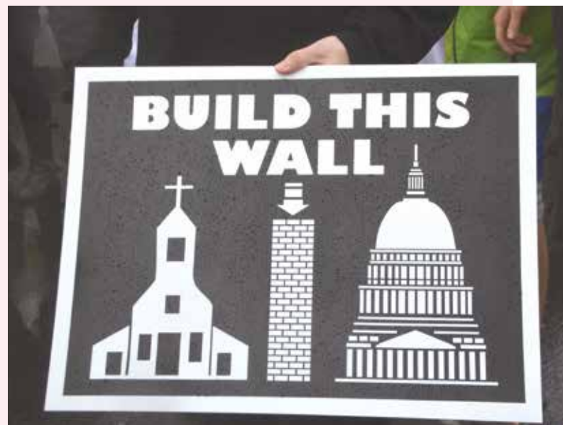
Secularism aims, in theory, for a value-neutral space, but usually results in hostility towards religion.

Yet secularism’s claim to create a value-free public space is deeply flawed. Consider, for example, recent U.S. Congressional hearings where appointees with conservative Christian views were not treated with neutrality, but with overt hostility. Supreme Court nominee Amy Coney Barrett, for instance, was told by Senate Judiciary Committee leader Dianne Feinstein, “The dogma lives loudly within you. And that’s of concern when you come to big issues that large numbers of people have fought for for years in this country.” 2