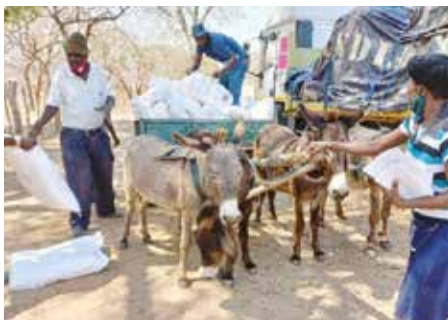
Onward transportation of ePap by donkey in Matabeleland, Zimbabwe.

The ePap delivery in November 2021 enabled families to receive sufficient provision for the Christmas break. At the time of writing 63 tons of ePap out of a planned total of 81 tons have been delivered to Zimbabwe, with further deliveries in early 2022 scheduled to cover the period to the end of the lean season when the next harvest is due.