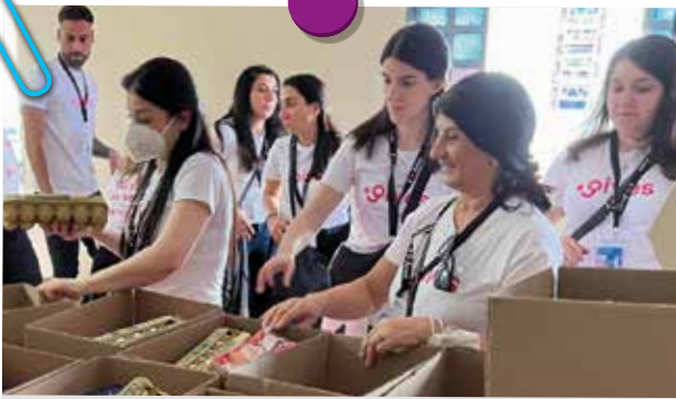
Youth group members worked like "busy bees" filling food.gives boxes in Brazil