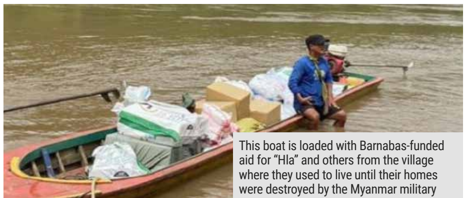
This boat is loaded with Barnabas-funded aid for “Hla” and others from the village where they used to live until their homes were destroyed by the Myanmar military

The partners shared the Word with the displaced families and prayed with them. These IDPs said that, whilst aid is greatly appreciated, it was the Word of God that encouraged them most.