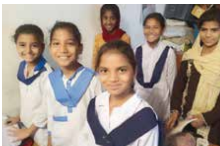
Supporting Christian schools – such as this one in Pakistan – is just one of the ways in which Barnabas Aid is sharing out the Lord's blessings

In the 12 months from 1 November 2021 to 31 October 2022, Barnabas funded 8,746 small business livelihood projects for around 43,730 Christians. We provided schooling for 10,405 children in 126 Christian schools, as well as training 1,451 apprentices and funding other vocational training.