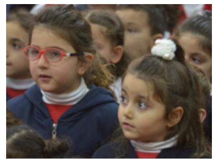
Kindergarten children begin their school journey in the safe and secure Christian environment at St Aphem's