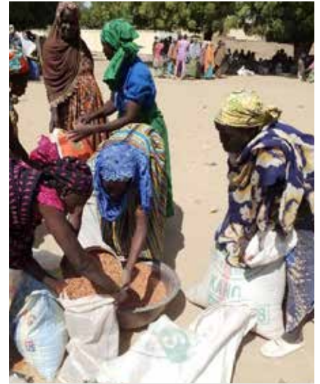
Women in Cameroon carefully share out grain into 50kg sacks