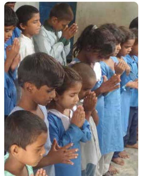
Children praying at a Christian school in Pakistan. Barnabas has helped believers in 109 different countries over the last 30 years

Please join us then, in not only giving thanks for all that God has done in these last 30 years, but also in praying that He will continue to bless and sustain the work of Barnabas as an aid agency to the suffering Church – perhaps for the next 30 years and beyond, however long remains until our Lord's return.