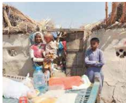
A Christian family with some of the food and practical aid they received from Barnabas

The aid became the “light of hope” for the families in Sindh province, one of the worst-affected areas, and strengthened their faith and trust in God their Provider, explained our project partners.