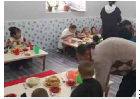
Barnabas funding has helped to provide heating in a rural church so that its dining room is now a comfortable space for meals and children's activities

Most of the congregation are converts from Islam. Many are pensioners because young, able-bodied people leave the area in search of work. As a result the church barely has enough to pay its utility bills.