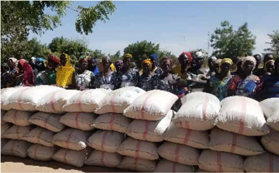
Bags of Barnabas-funded maize ready to be distributed to Cameroonian Christians in need