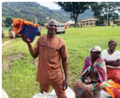
Christians welcome the arrival of Barnabas-funded food and practical aid

We provided food, blankets, mats, mosquito nets and roofing sheets for displaced Christians following attacks in five Christian villages in Kagoro chieftdom, Kaduna State. Fulani extremists had looted the communities, razed homes and displaced thousands of villagers.