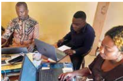
Translators work on the Flame language draft of Judges.

Project Reference: 00-362 (Bibles and Scriptures Fund)