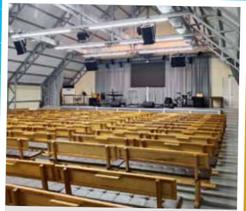
This new Uzbek church building, partially funded by Barnabas, is designed to be easy to dismantle and rebuild.

"P raise the LORD, all you nations ... For great is his love towards us, and the faithfulness of the LORD endures forever."