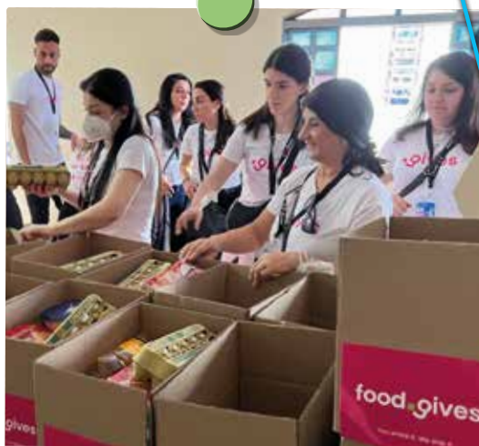
Youth group members worked like “busy bees” filling food.gives boxes in Brazil.

A German church leader thanked youth group members for their hard work. “I saw how you packed the food boxes like busy bees and give them to the brothers and sisters in need,” he said.