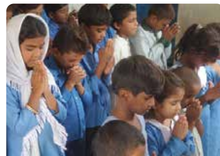
Children praying at a Christian school in Pakistan. Barnabas has helped believers in 109 different countries over the last 30 years.

Please join us then, in not only giving thanks for all that God has done in these last 30 years, but also in praying that He will continue to bless and sustain the work of Barnabas as an aid agency to the suffering Church – perhaps for the next 30 years and beyond, however long remains until our Lord's return.