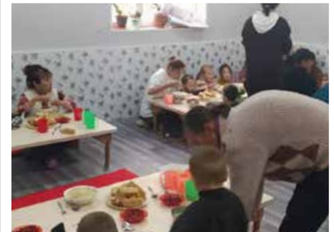
Barnabas funding has helped to provide heating in a rural church so that its dining room is now a comfortable space for meals and children's activities.

Most of the congregation are converts from Islam. Many are retired because young, able-bodied people leave the area in search of work. As a result, the church barely has enough to pay its utility bills.