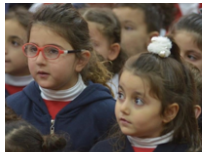
Kindergarten children begin their school journey in the safe and secure Christian environment at St Aphrem's.