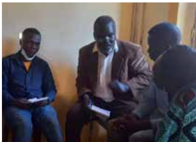
Sudanese students take part in group discussions as part of their pastorship training.

Another 140 students have used the college teaching materials to train 3,300 leaders and members in their home churches. This is helping to strengthen the country’s small Christian community, persecuted for many decades by the Muslim majority.