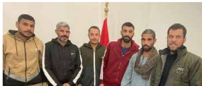
Six Egyptian Christians have been released after being abducted in Libya.

Christians are permitted to worship in unregistered buildings pending the completion of the licensing process.