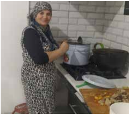
Barnabas funding has enabled hot water to be provided in a rural church's newly refitted kitchen.

These opening verses of Psalm 117 were chosen by a congregation in Uzbekistan to give thanks to God for the construction of their new church building, partly funded by Barnabas.