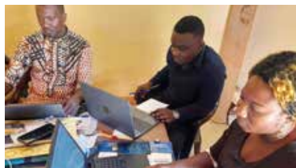
Supporting Christian schools – such as this one in Pakistan – is just one of the ways in which Barnabas Aid is sharing out the Lord's blessings.

In the 12 months from November 1, 2021, to October 31, 2022, Barnabas funded 8,746 small business livelihood projects for around 43,730 Christians. We provided schooling for 10,405 children in 126 Christian schools, as well as training 1,451 apprentices and funding other vocational training.