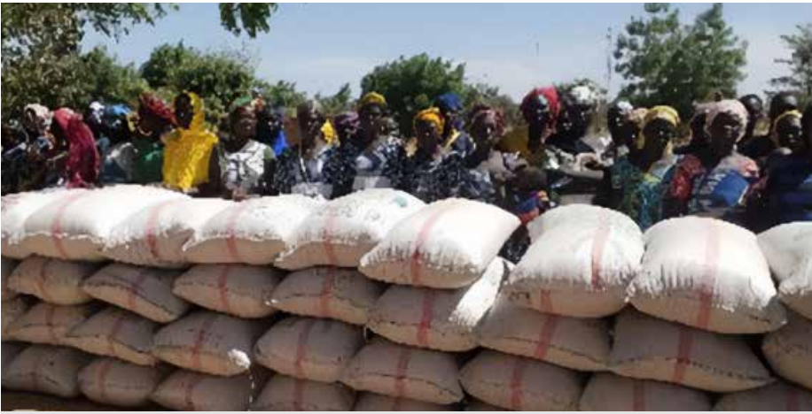
Bags of Barnabas-funded maize ready to be distributed to Cameroonians Christians.