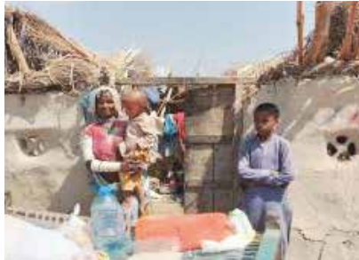
A Christian family with some of the food and practical aid they received from Barnabas.

The aid became the “light of hope” for the families in Sindh province, one of the worst-affected areas, and strengthened their faith and trust in God their Provider, explained our project partners.