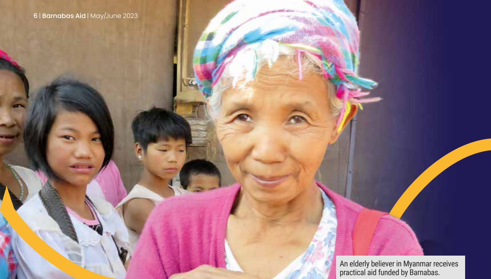
An elderly believer in Myanmar receives practical aid funded by Barnabas.