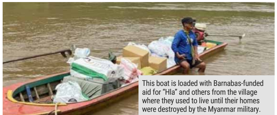
This boat is loaded with Barnabas-funded aid for “Hla” and others from the village where they used to live until their homes were destroyed by the Myanmar military.

The partners shared the Word with the displaced families and prayed with them. These IDPs said that, whilst aid is greatly appreciated, it was the Word of God that encouraged them most.