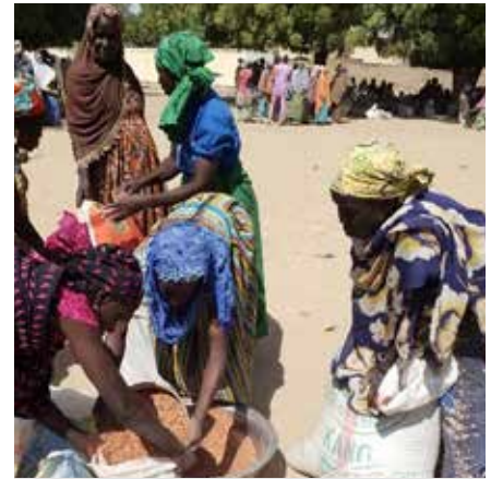
Women in Cameroon carefully share out grain into 110 lb. sacks.