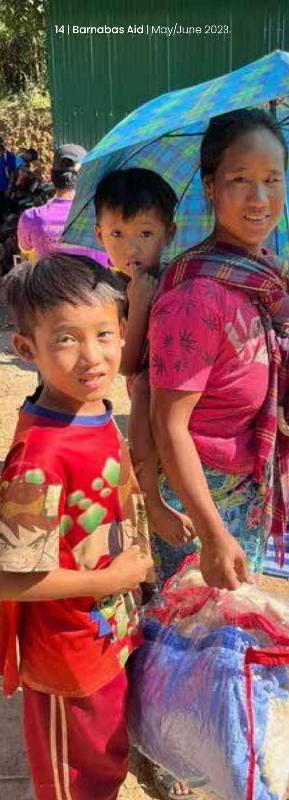
A Christian mother and two children, displaced from their home, receive Barnabas-funded food and blankets.

T he Myanmar military came into our village and started shooting big guns ... They burned down our entire village. Besides this, they also attacked us by air with war planes shooting and bombing our areas.”