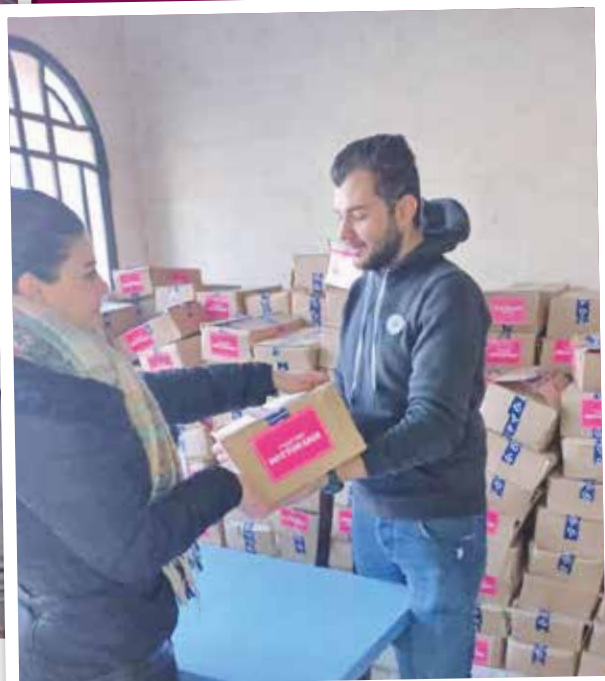
A Christian in Aleppo receives one of 1,500 food.gives boxes distributed within days of the earthquakes.

The boxes, given out by our project partners on the ground, contained ingredients for many nutritious meals, including rice, lentils,