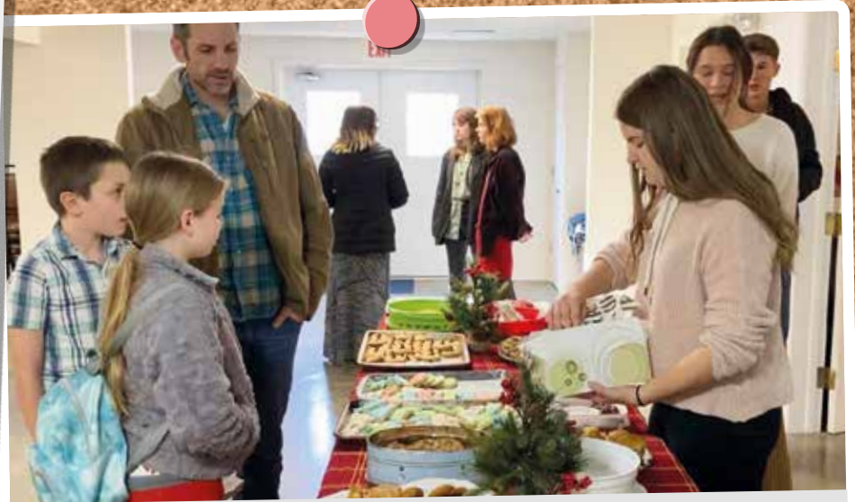
Youth class members of Grace Bible Church find customers eager to buy their home-baked cookies and breads.

“The teens had a great time working together and were excited to be able to help in this way,” said the church pastor.