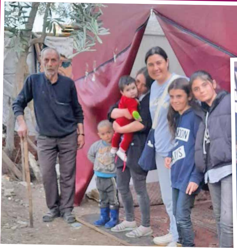
One of the large, heavy-duty tents sheltering Christians in Turkey.