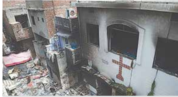
Debris litters the street outside one of the churches attacked in Jaranwala

“We highly appreciate that Barnabas Aid stood side by side with us in our hard times and gave us hope and feelings that our big global family in Christ always cares for us.”