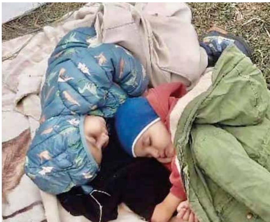
Armenian Christian children among the thousands displaced from Nagorno-Karabakh