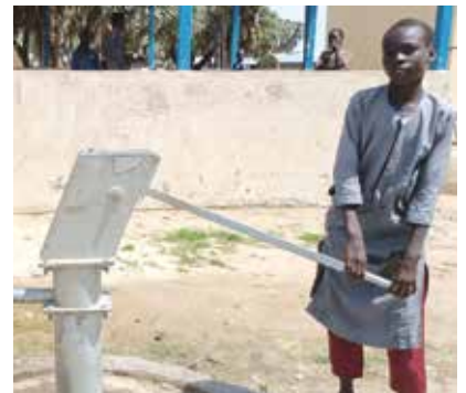
A young Christian refugee draws water from a Barnabas-funded borewell

Barnabas funded the drilling of two boreholes on church land close to the camp that produce clean water, so the families are no longer sick. The boreholes also mean the women no longer have to risk walking a long distance from the camp to draw water. They thanked God for "this testimony of love".