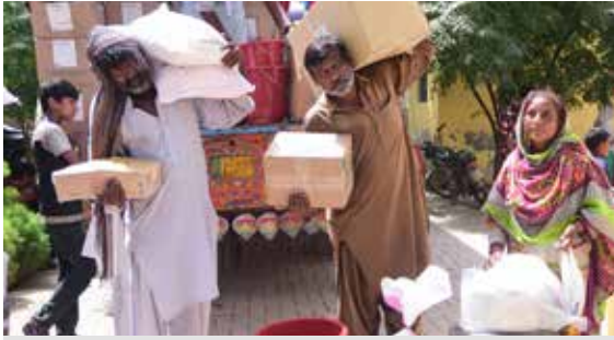
Christian victims of the violence pick up Barnabas-funded food, hygiene supplies and household equipment

powder and women's sanitary pads; as well as two plastic buckets and two mugs.