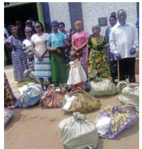
Vulnerable members of the Ugandan Christian community around the school collect bundles of Barnabas-funded food aid

“Keep praying for me to get healed and go back to school,” he requested. “My ambition is to finish school and work for the community.”