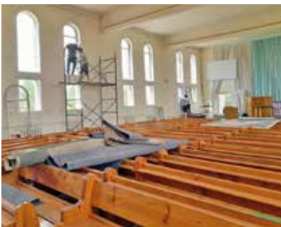
New windows help to keep out the bitter cold