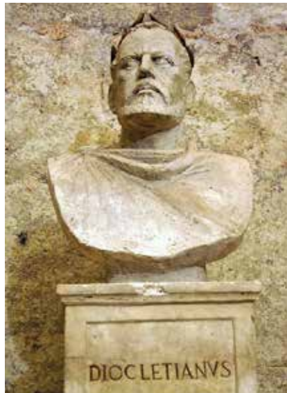
Emperor Diocletian

destroyed. Christians in public service were demoted and deprived of their civil rights. Christian freedmen were made slaves again, which meant they could legally be tortured. The day before issuing this edict, Diocletian had ordered that a church building in Nicomedia, near to the imperial palace, be razed to the ground and its Scriptures burned.