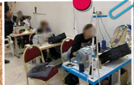
Egyptian Christian women receive Barnabas-funded training in sewing

Could your church or group take up a special Christmas offering to make a difference to the lives of our suffering Church family who need our help?