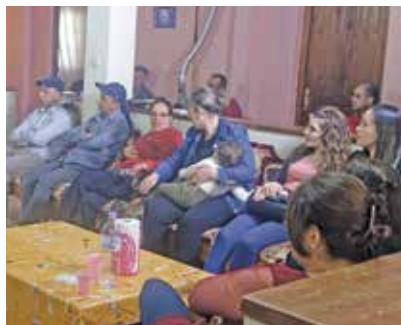
Algerian Christians meeting in small groups after the forced closure of their churches

"The support we are receiving from Barnabas is a great answer to prayer, and our ministry is revived," said one pastor. He has started six home groups, and visits believers for pastoral care, training and discipleship.