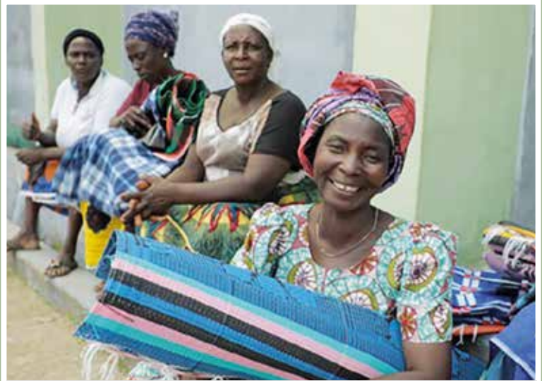
Christian women receive sleeping mats and blankets in the latest Barnabas-funded distribution of aid to Nigerian victims of violence

“Though the government here refused to assist the people, God has sent help from above through Barnabas Aid.”