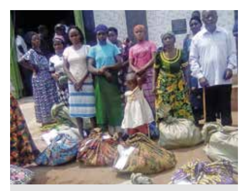
Vulnerable members of the Ugandan Christian community around the school. collect bundles of Barnabas-funded food aid

"Keep praying for me to get healed and go back to school," he requested. "My ambition is to finish school and work for the community."