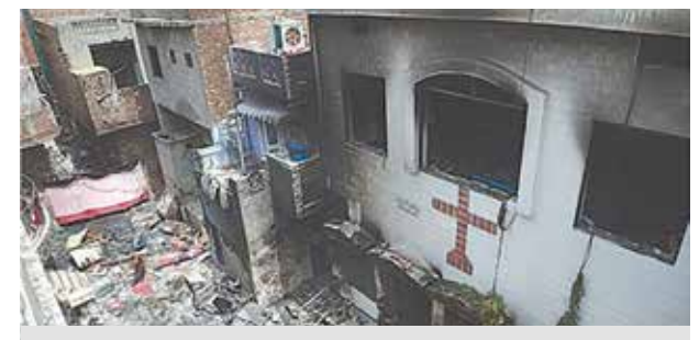
Debris litters the street outside one of the churches attacked in Jaranwala.

"We highly appreciate that Barnabas Aid stood side by side with us in our hard times and gave us hope and feelings that our big global family in Christ always cares for us."