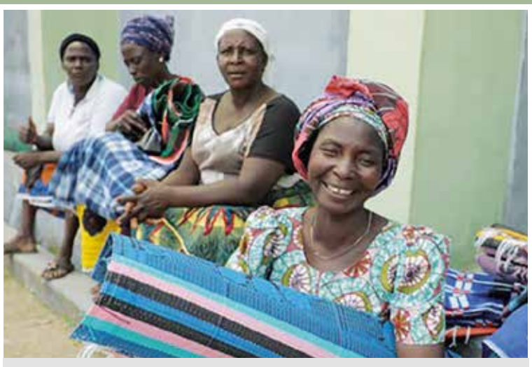
Christian women receive sleeping mats and blankets in the latest Barnabas-funded distribution of aid to Nigerian victims of violence.

"Though the government here refused to assist the people, God has sent help from above through Barnabas Aid."