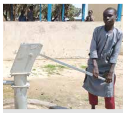
A young Christian refugee draws water from a Barnabas-funded borewell.

Barnabas funded the drilling of two boreholes on church land, close to the camp, that produce clean water so the families are no longer sick. The boreholes also mean the women no longer have to risk walking a long distance from the camp to draw water. They thanked God for "this testimony of love."