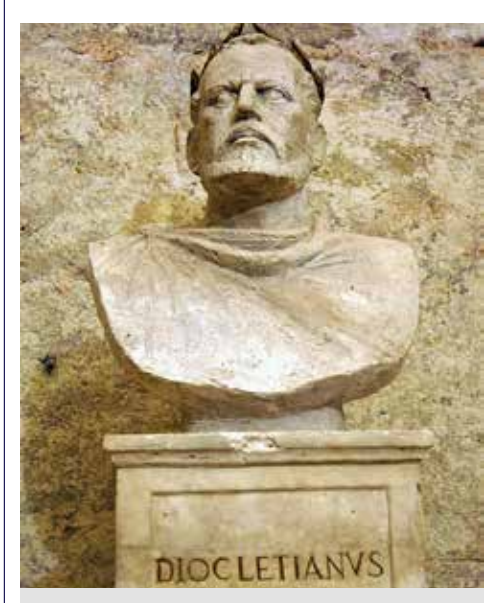
Emperor Diocletian.

No penalties were mentioned in the first edict, so local magistrates could be as harsh or lenient as they chose in punishing transgressors. The later edicts became gradually more specific and severe. The second edict ordered church leaders to