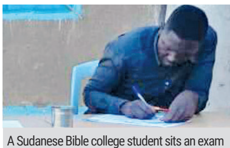
A Sudanese Bible college student sits an exam

TUESDAY 6 Give thanks for the Lord's protection over a Bible college in Sudan, a land where Christians have for many decades been persecuted by the Muslim majority. The country has been in political turmoil since a military coup of October 2021, which threatens to roll back positive changes towards greater religious freedom made by the previous administration. Despite this instability, the Bible college has been able to serve and grow, training new church leaders with campus-based and distance learning courses, as well as holding regular meetings to strengthen serving pastors. Ask that God will guide college leaders with His wisdom to know how to train and spiritually equip students in their ministry for years to come, advancing His kingdom in Sudan.