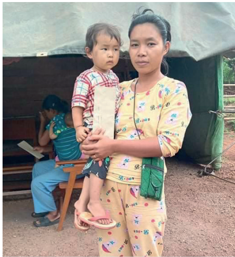
This Christian mother from Myanmar was among 3,500 internally displaced people who recently received Barnabas-funded aid