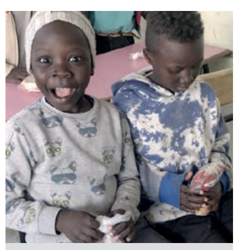
Barnabas-funded food brings joy to Sudanese Christian refugees in Egypt

the ongoing violence, asking that there will be peace in this troubled land.