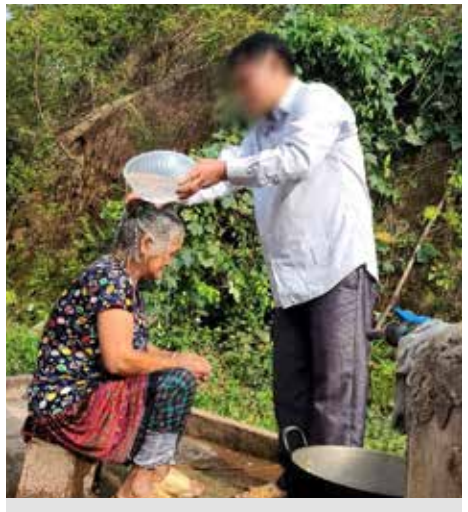
Baptism in a remote mountain community in Vietnam

the faith despite the pressures they face. Barnabas Aid helps to support them.