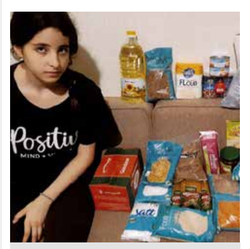
A Christian in southern Lebanon, with food aid from Barnabas for her family

among those in the south, from where many are fleeing. Lebanon is already sheltering about 1.5 million refugees, mainly from Syria, including Christians. The situation is putting additional strain on the country's crisis-hit economy. Pray for peace in the region. Ask for guidance for Lebanon's leaders in bringing the economy under control. Pray that our brothers and sisters seek refuge in the Lord (Psalm 34:4).